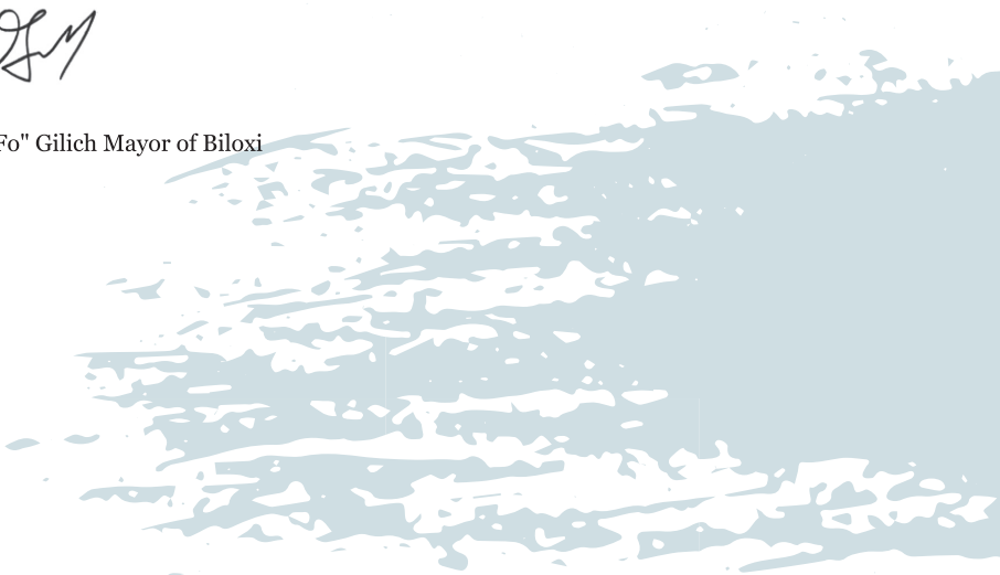
Andrew "FoFo" Gilich Mayor of Biloxi

A handwritten signature in black ink, which appears to be "FoFo Gilich". The signature is stylized and written in a cursive-like font.